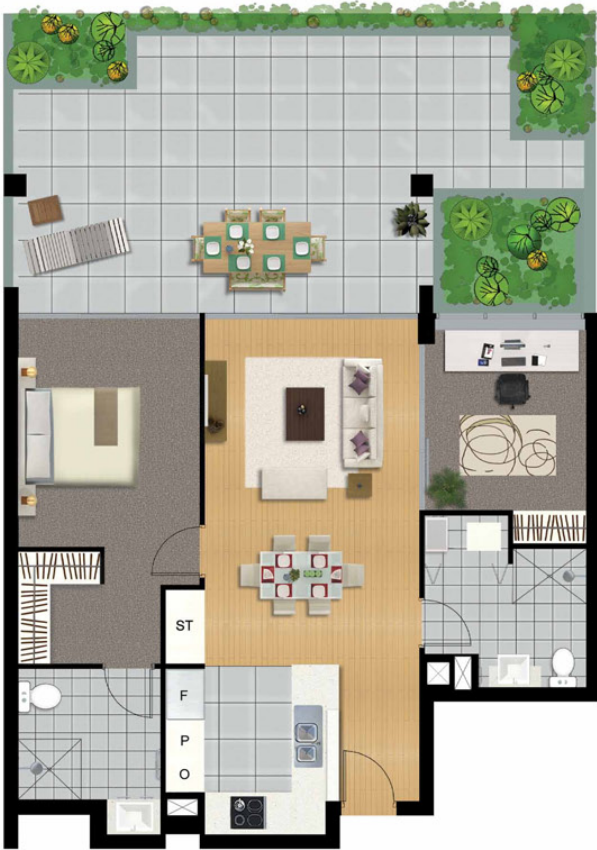
Apt no. 106 (Courtyard Apt 124.7m 2 )